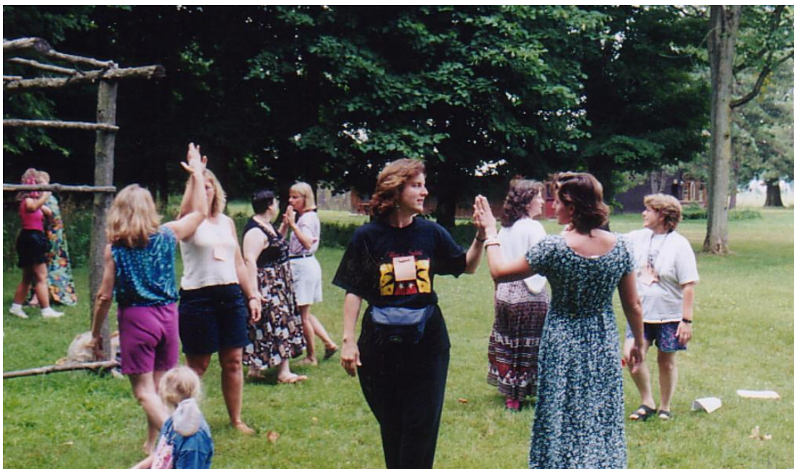
Dancing at the CMwD W&R Summer Retreat, August 1997